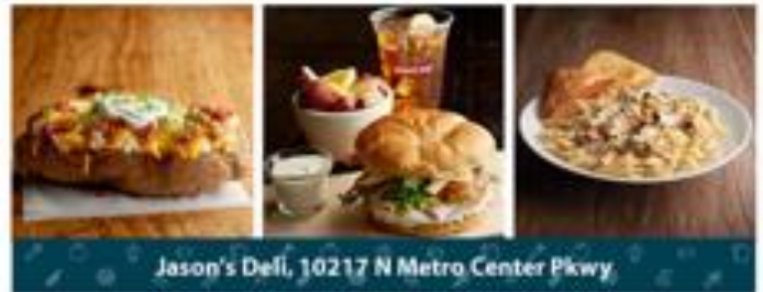
Jason's Deli, 10217 N Metro Center Pkwy.

Mention this fundraiser to your cashier when dining in to make sure your organization gets credit for your purchase. We appreciate you using Jason's Deli to support your fundraising needs.